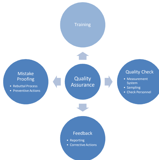
Fig 1: Quality Assurance - High Level Classification

Quality assurance encompasses a wide array of topics and this document is a primer, creating a base for discussion, training and process improvement.